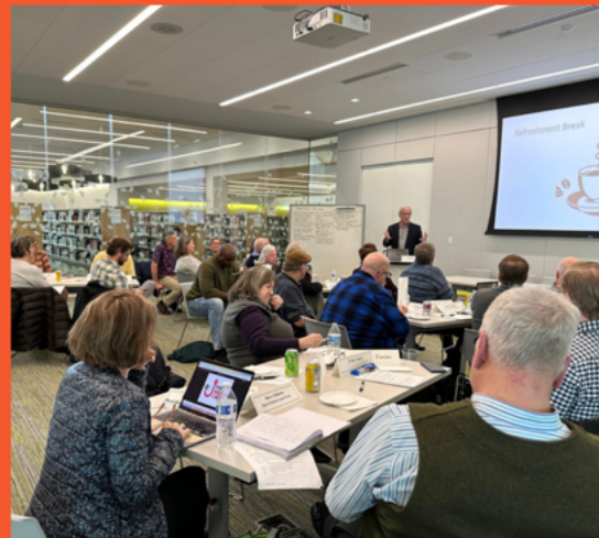
Shoptalk participants from six nonprofit news organizations from across the country gather at the Eden Prairie Library in February 2023.

That's a trend EPLN is helping to reverse. The number of nonprofit newsrooms in the United States has more than doubled in the last five years, and EPLN is among them.