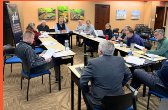
The EPLN Board of Directors meets every other month to conduct business.